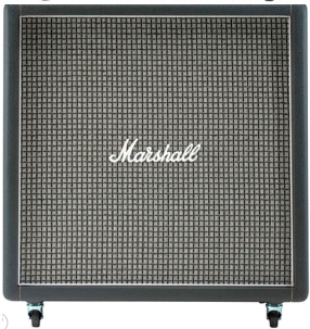
1960 BX Cabinet Celestion G12M/25"